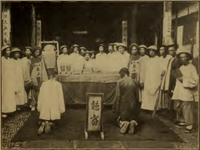
CHINESE COURT OF JUSTICE.